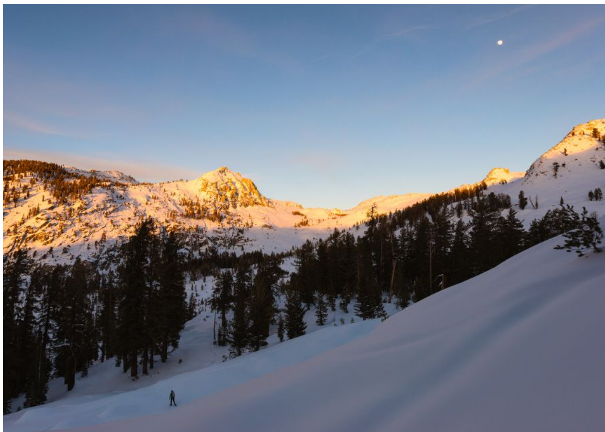
Backpacking / Snowshoeing in the Sierra Nevada Range of California

Backpacking in the winter will require you to strap some gear to the the outside of your pack. Here is what I carry during the winter only.